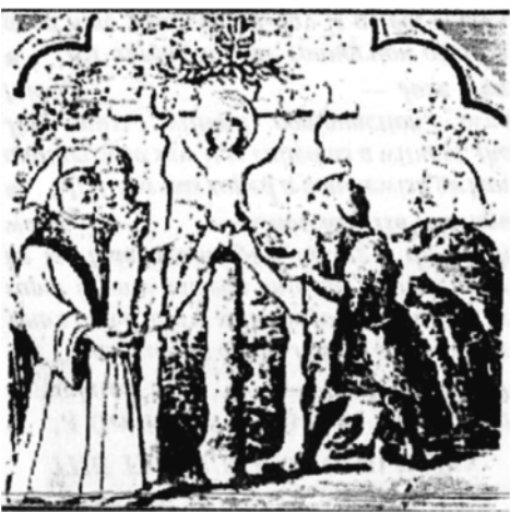
A contemporary depiction of the martyrdom of St. William of Norwich by fanatical Tulmudists in 1144

Two months course it could cidence nouncement of the body of a the car park of gogue in Clap-A number of being asked by the percepormed.